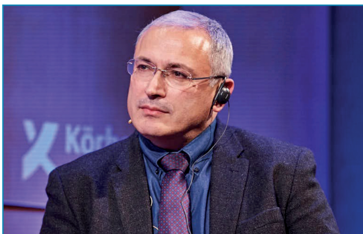
Interview with Mikhail Chodorkovsky (Der Spiegel & Körber Foundation) | 2018