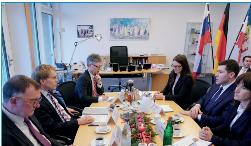
Bilateral Visit of the Kalinigrad Delegation to Schleswig-Holstein | 2019