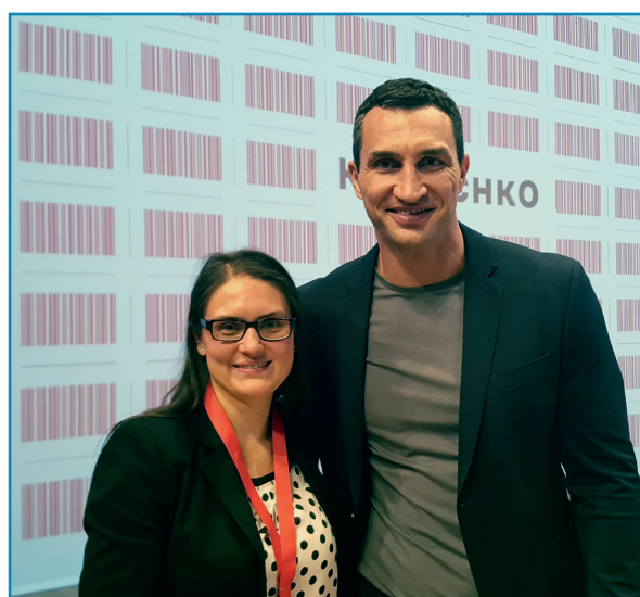
Klitschko Brand Event | 2017